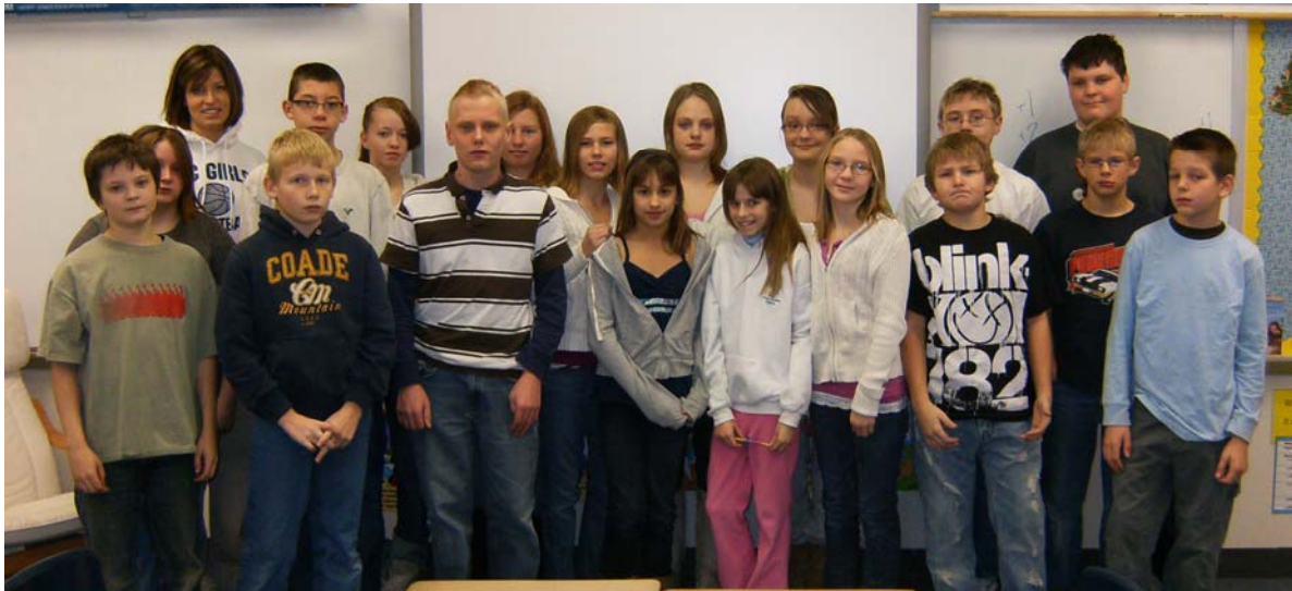
Mrs. Whittaker’s Power Hour raised $80.00 during the “One for Water” campaign.